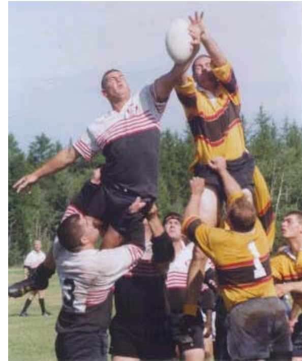
An example of a line out

Two rows of forwards standing up (one column per team) line up 5 meters in from the touch line and perpendicular to it. A player from the team who didn't touch it last before it went onto touch gets to throw the ball in, down the tunnel.