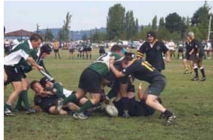
An example of a ruck. See the ball on the ground?

In our example above, to form a ruck, the outside center would start shoving the tackler that was getting up, who would, of course, shove back. Folks from your team and from the other team would join in, until the scrumhalf came to clear the ball out to the backs again, who have quickly realigned.