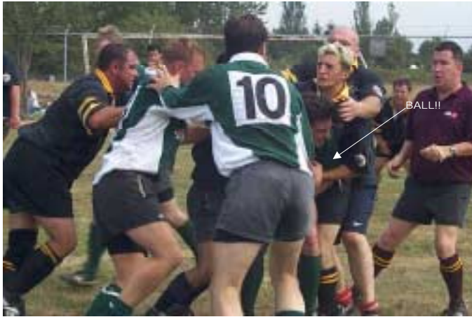
An example of a maul.

a player standing up with the ball in his possession.