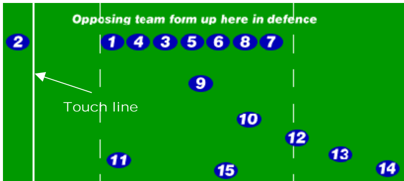
A diagram of one side of a line out.

If the ball is kicked, carried, or otherwise escorted into touch (“out-of-bounds”), its re-entry onto the field is by way of a lineout . A line out is kinda like the jumpball in basketball.